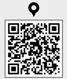
MAYUR INDUSTRIAL PARK - II ANANDPUR, DHOLERA